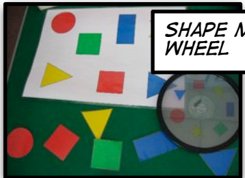
SHAPE MATCHING WHEEL