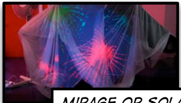
MIRAGE OR SOLAR PROJECTOR ONTO A NET