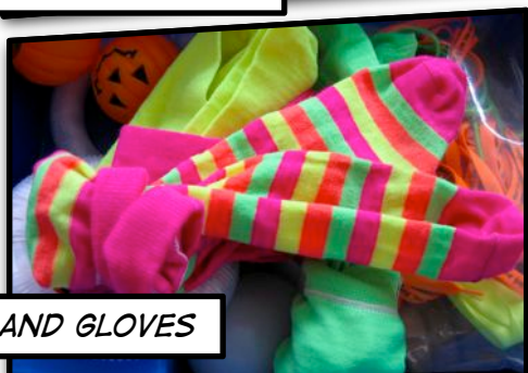
SOCKS AND GLOVES